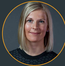
Bailey Bram Ice Hockey Olympian

Mo'ath uses sport - running in particular - to promote peace in the Middle East and North Africa.